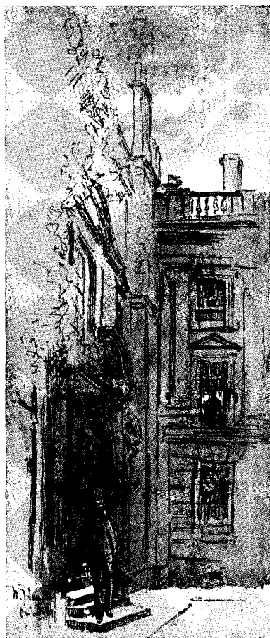
"HE SAW HIS NEIGHBOR'S HEAD AT THE WINDOW OUTLINED AGAINST THE LAMP-LIGHT."

single soul upon his way. He walked briskly along until he came to the avenue gate, which opened into the long gravel drive leading up to Farlingford. In front of him he could see the cozy red light of the windows glimmering through the foliage. He stood with his hand upon the iron latch of the swinging gate, and he glanced back at the road along which he had come. Something was coming swiftly down it.